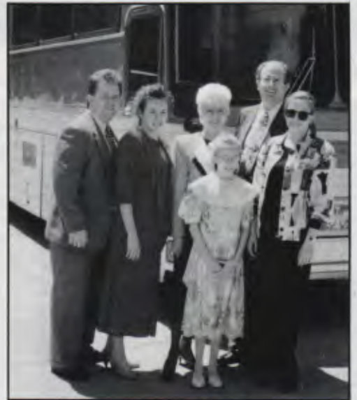
1994 Easter Sunday in Florida