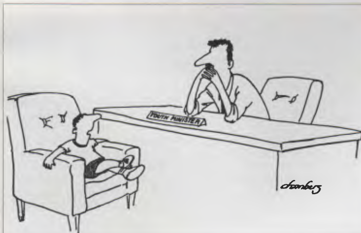
So...what do you do the rest of the week? You got a job or something?

"Let me always know exactly where the pastor is and when he will be back, even though he never tells me when he leaves. And Lord, when the year ends, please give me the foresight not to throw out records that will be asked for in a few days, even though I was told emphatically, 'Destroy these - they are cluttering up the place! Amen.'"