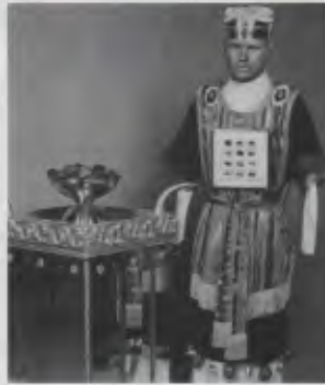
"Temple Treasures" Display