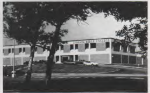
Above: The campus of Indiana Bible College, Indianapolis, IN.