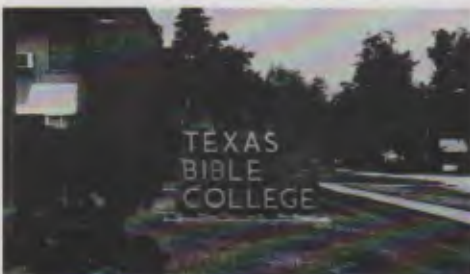
Apostolic Bible colleges are fairly well dispersed throughout the USA. Most all have adequate facilities and maintain a solid academic standard. Top: Gateway College of Evangelism, St. Louis, MO; Middle: Christian Life College, Stockton, CA; Bottom: Texas Bible College, Houston, TX.

T he Apostolic rumor mill is an amazing thing. Consider these myths often heard through the Pentecostal grapevine: