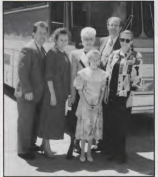
1994 Easter Sunday in Florida