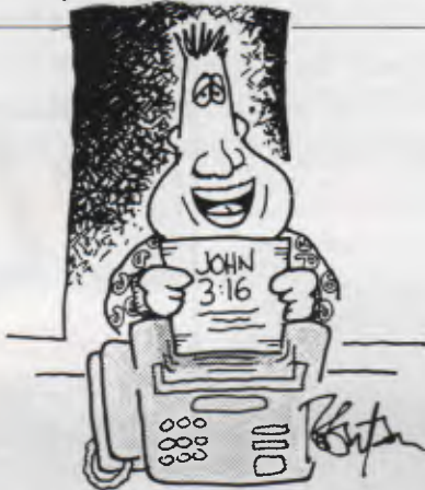
I LIKE TO CALL IT A "TRAX-FAX." IT'S THE 90'S WAY OF NON-CONFRONTATIONAL WITNESSING