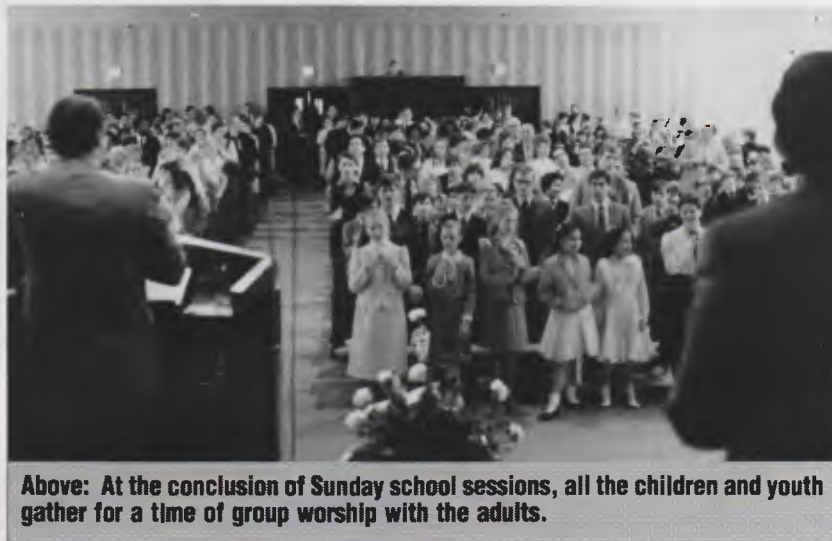
Above: At the conclusion of Sunday school sessions, all the children and youth gather for a time of group worship with the adults.