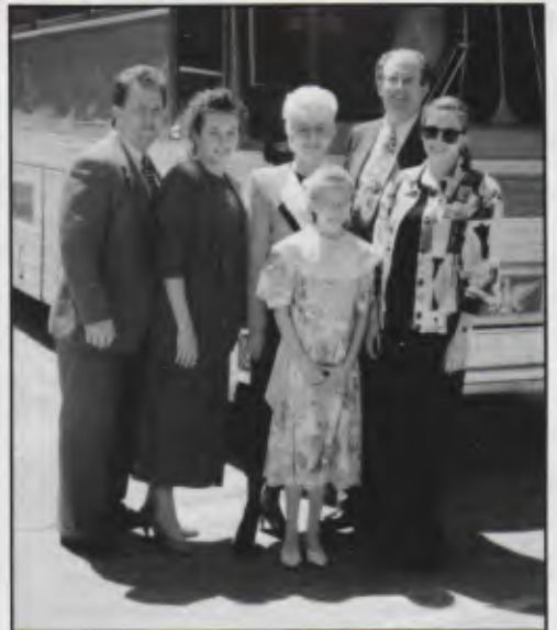
1994 Easter Sunday in Florida