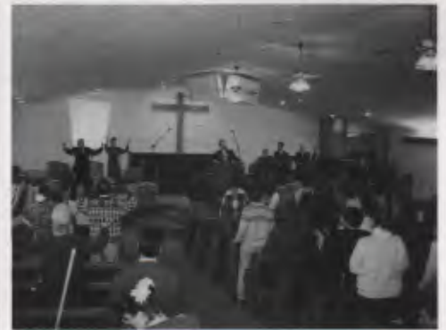
Above: The congregation at First United Pentecostal Church, Naples, FL.