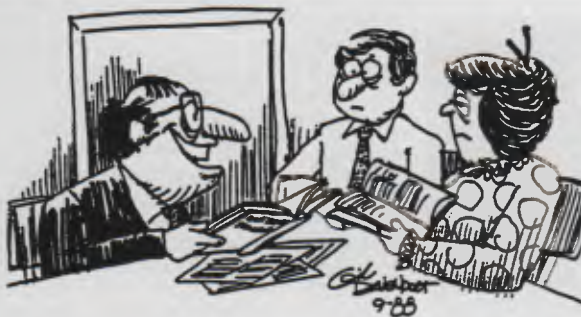
When I was a kid I would go up to someone's porch, ring the doorbell, and run. I still do it, except now it's called 'Outreach Training'.

The first replied, “I'm afraid God might ask me the same question.”