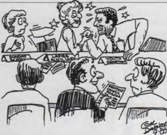
“They both wanted to use the church van next Saturday . . .”

“God forbid that we should emphasize educational preparation above spiritual; but God pity the man who has an ax without a handle.”