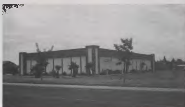
Below: Exterior view of Abundant Life Christian Center.

ister at the Modesto church knows that teaching studies is something that is expected: "I have had very few ministers to work with me until recently. One who came on full-time just four months ago now has three major responsibilities: the youth department, outreach and home Bible studies. I also have a Christian school principal who is a minister-in-training. And of course, he's also required to teach home Bible studies."