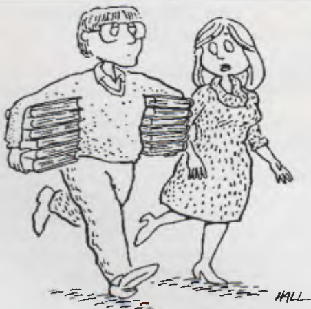
“I’VE DATED GUYS WHO CARRIED BIBLES BUT NEVER ANYONE WHO CARRIED A TWELVE-VOLUME COMMENTARY.”

Billy looked up at the pastor with confidence and said, “Believe it?! That was my dog!”