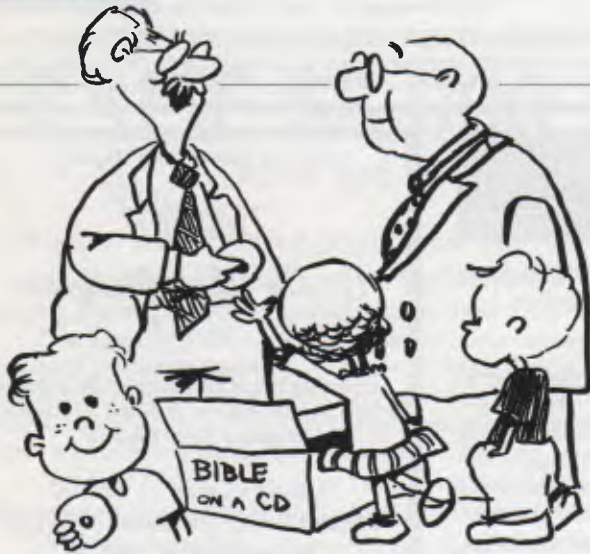
"Remember when we gave them little blue or white New Testaments?"

The new home missions pastor of a rural community was talking to one of the few saints from his church: "So Sister Mildred, how did Hank lose the fingers off his right hand?"