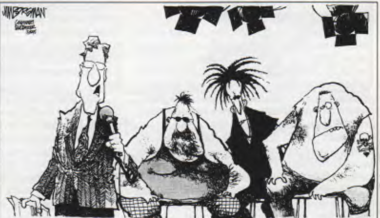
"TALK SHOWS: DO THEY DISTORT REALITY? WE'LL ASK THESE THREE MORBIDLY SWEATY SERIAL KILLERS WITH OVERBITES ON THE NEXT Springer."

Sunday School Teacher: Scofield or Thompson Chain Reference. Mark the individual books with special adhesive tabs. Use 12 different Hi-Liters, color-code each and every verse. Carry a Strong's Exhaustive Concordance, a Bible dictionary, a Halley's Bible Handbook, and three notebooks (not to mention a bottle of Tylenol) with your Bible at all times.