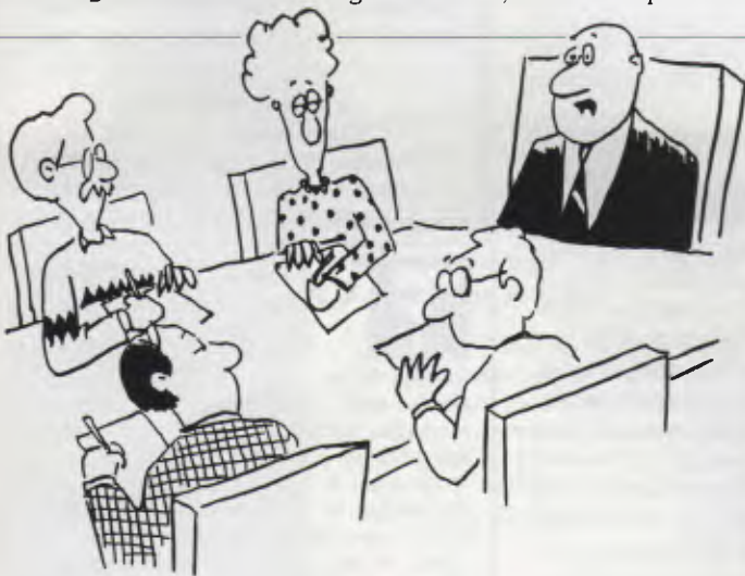
Our giving is on budget for March. Unfortunately, it's now September.

Always remember: God gives the milk, but not the pail.